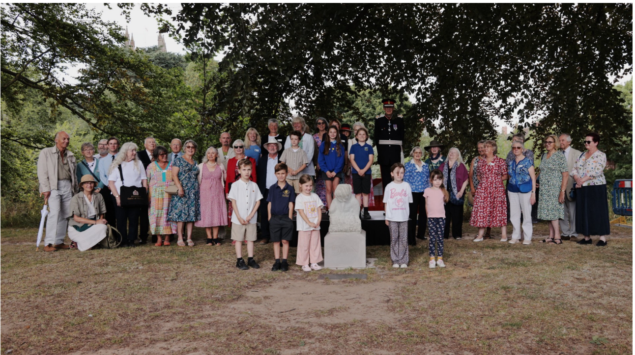
Hereford Guild of Mayor's Guides and the winning children